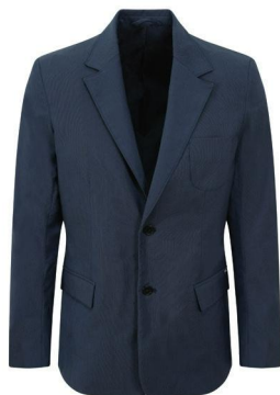
Men's Suit Jacket - Navy