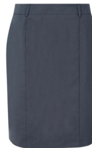
Ladies' Pencil Skirt - Navy