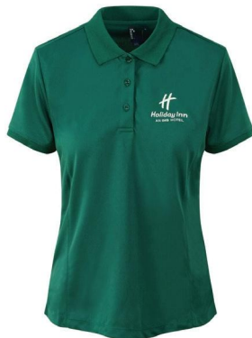
Ladies' Short Sleeve Polo Shirt - Green