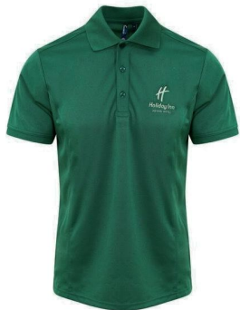
Men's Short Sleeve Polo Shirt - Green