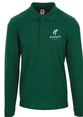
Unisex Long Sleeve Polo Shirt - Green