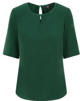
Ladies' Short Sleeve Soft Blouse - Green