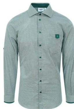
Men's Roll-Up Sleeve Shirt - Green/White Micro Check