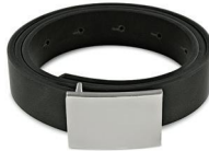
Unisex Belt - Grey Single pack PVID IHUBT01GY - £5.20 Size Range S - 3XL