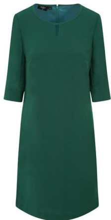
Ladies' Shift Dress - Green