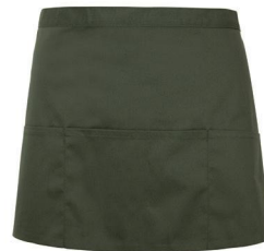
Unisex Short Apron - Charcoal