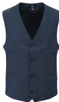
Men's Waistcoat - Navy