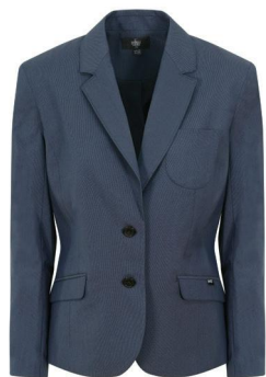
Ladies' Suit Jacket - Navy