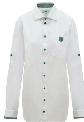
Men's Roll-Up Sleeve Shirt - White