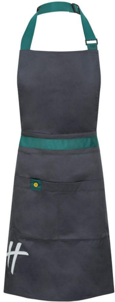
Unisex Bib / Waist Apron - Charcoal Single pack PVID HIUAP01GY - £14.95 Twin pack PVID HIUAP21GY - £28.10 Size Range ONE SIZE