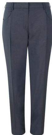
Ladies' Trouser - Navy