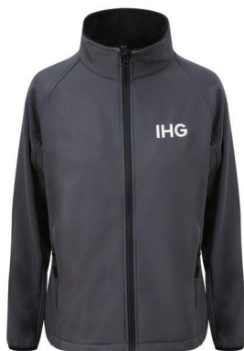
Ladies' Soft Shell Jacket - Grey

Trousers are delivered unhemmed (36" length) with wonderweb pack to finish to your required length