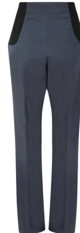
Maternity Trouser - Navy Single pack PVID IHFMT01NV - £26.60 Size Range XS - XL

Trousers are delivered unhemmed (36" length) with wonderweb pack to finish to your required length