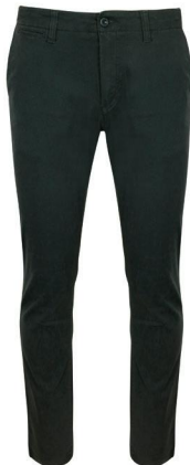
Men's Chino Trousers - Charcoal