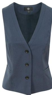
Ladies' Waistcoat - Navy