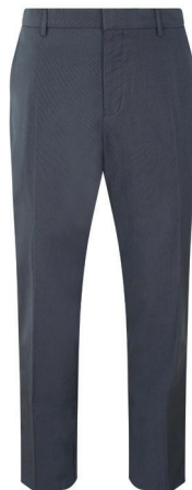
Men's Trouser - Navy