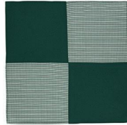
Unisex Pocket Square - Green/Micro Check (Worn with suit jacket) Single pack PVID HIUSQ01MU - £3.90 Size Range ONE SIZE (P)