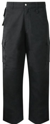
Men's Cargo Trousers - Black

Trousers are delivered unhemmed (36" length) with wonderweb pack to finish to your required length