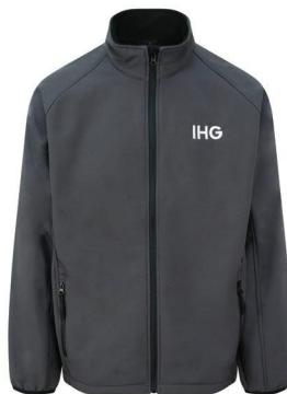
Men's Soft Shell Jacket - Grey